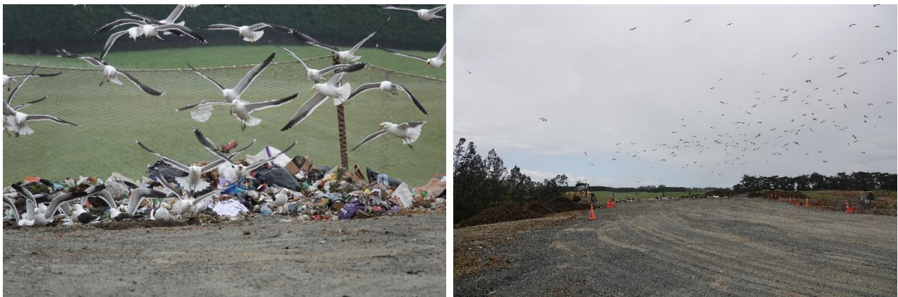
Figure 3: Black-backed gulls at the Mt Cooe landfill competing for a piece of meat (left) and flocking above the landfill (right). 4 November 2022.

Only a few small passerines were seen in open areas such as the borrow pit and in grassed/weedy areas. The perimeter drain, which was dry during the site visit, did not appear to provide good habitat for birds. The settling ponds also did not provide good habitat for birds, with only one welcome swallow ( Hirundo neoxena ) observed briefly at the site. The other passerines present near the ponds were associated with adjacent trees and grassland.