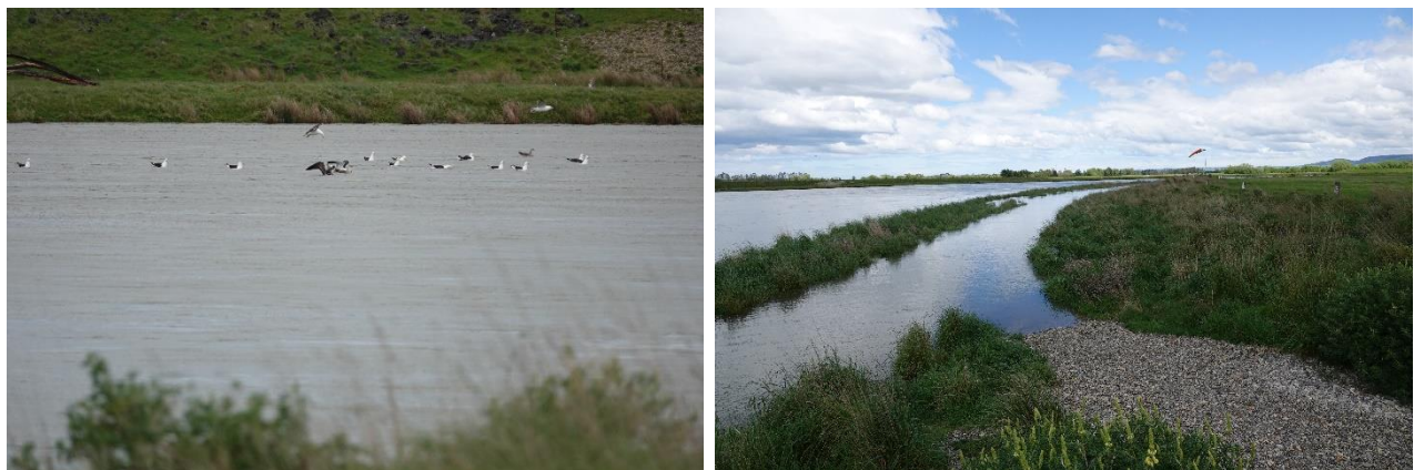
Figure 7: Black-backed gulls on the Balclutha River between the aerodrome and Kaitangata Highway (left) and the eastern end of the runway where it abuts the river (right). 4 November 2022.

Numerous black-backed gulls were observed floating and flying down the river. Mallards were observed in the river at the eastern end of the runway (Figure 7). Occasional oystercatchers could be heard flying along the river. Several rock pigeons ( Columba livia ) were perched on the railway bridge which passes over the Clutha River between the landfill and the aerodrome.