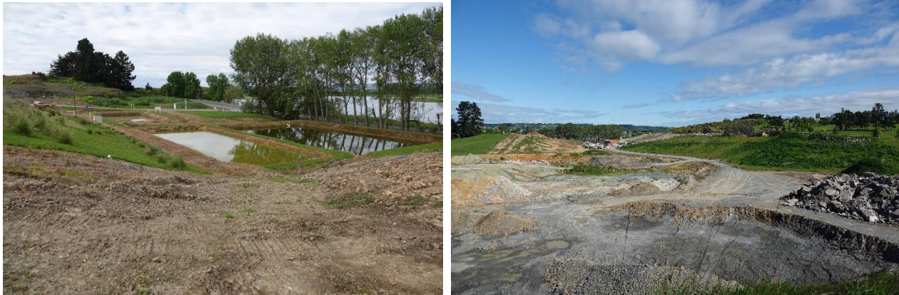
Figure 4: Settling ponds (left) and the borrow pit (right) provide low quality habitat for birds. 4 November 2022.