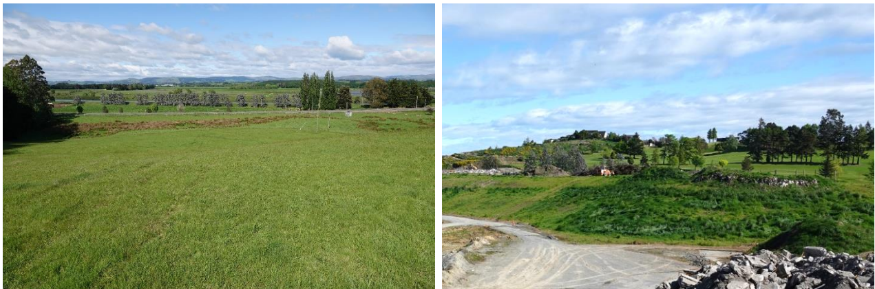
Figure 5: The proposed expansion area at the Mt Cooee landfill largely comprises pasture, with some trees and small buildings on its margins (left). Exotic grassland is also present on the adjacent Balclutha Golf Club course (right) and surrounding farmland. 4 November 2022.

Spur-winged plovers, starlings, and several other small passerine species were recorded in and adjacent to the proposed expansion area (Appendix A). Starlings were nesting in small buildings adjacent to the expansion area. A range of other species flew over the site, including black-backed gulls on route to the landfill. Extensive similar habitat is present nearby on farmland and the Balclutha Golf Club course. A wet area at the foot of the hillslope (dominated by rushes) and a small, muddy stream provided low quality habitat for wetland birds.