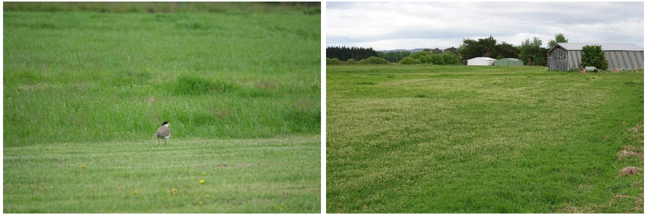
Figure 6: Spur-winged plover on the runway (left) and hangers at the western end of the aerodrome (right). 4 November 2022.

Spur-winged plovers are regularly seen on the airfield and black-backed gulls congregate on the Clutha River at the eastern end of the airfield (Israel Win, South Otago Aero Club, pers. comm. 4/11/2022).