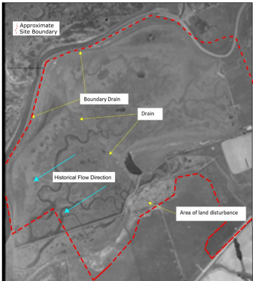
Figure 2 1942 Aerial photos showing pre existing landform

24 Mr Baker has outlined concerns with regards to the offsite migration of leachate within the deeper estuarine sediments (LKEM) and in particular at the southwest edge of the landfill. This area is considered to be hydraulically down gradient of the landfill based on the flow paths of historic channels on the estuarine sediments as shown in the 1942 aerial photographs (Figure 2).