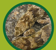
Southern Alps gecko