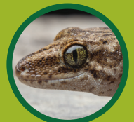
Mountain beech gecko