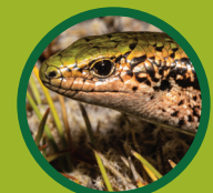
Southland green skink