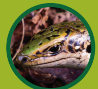
Otago green skink