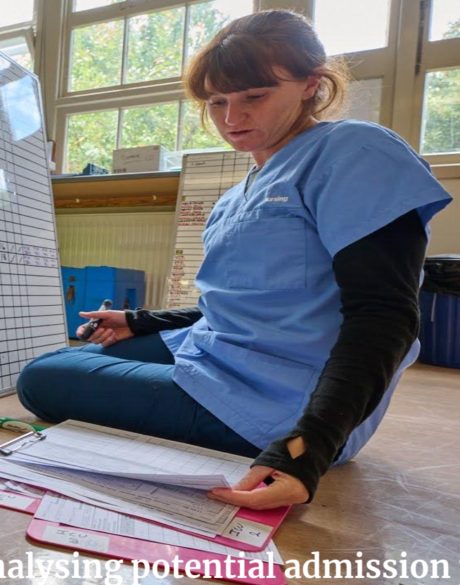
Coordinating lay dates with field teams & analysing potential admission peaks