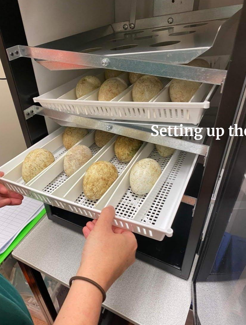
Setting up the hoiho hatchery