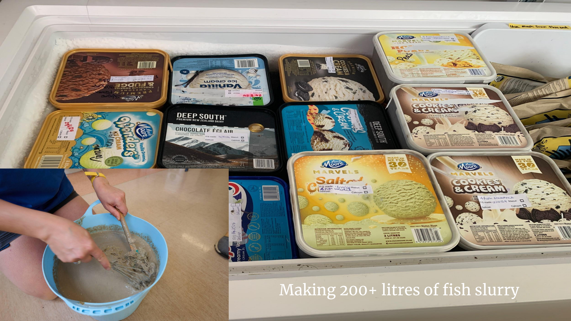
Making 200+ litres of fish slurry