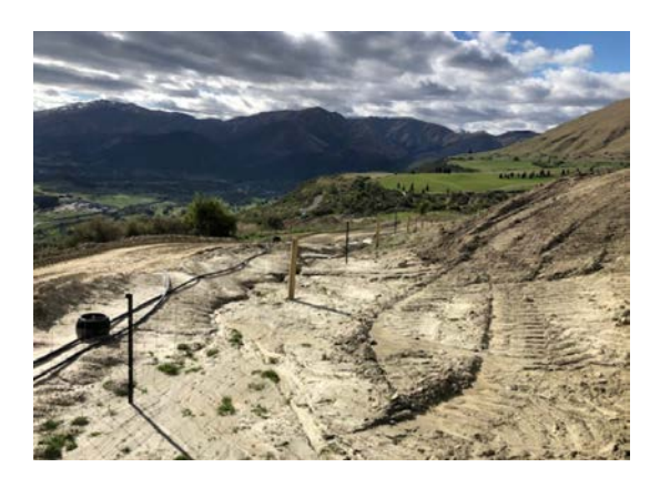
Earth works on escarpment facing North