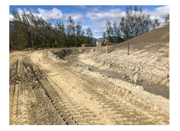
Earth Works with silt wash in small stream

Applicant's Property facing West with Queenstown in the Distance