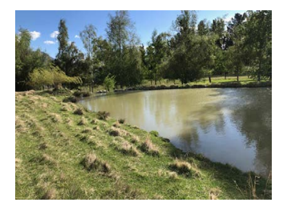
Neighbours Pond full of silt