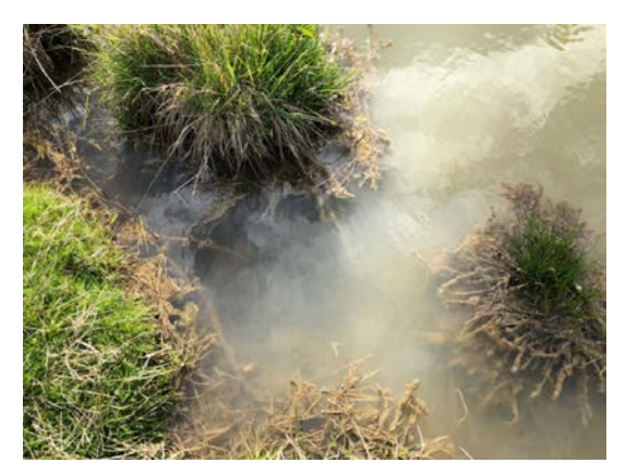
Close up of silt in pond