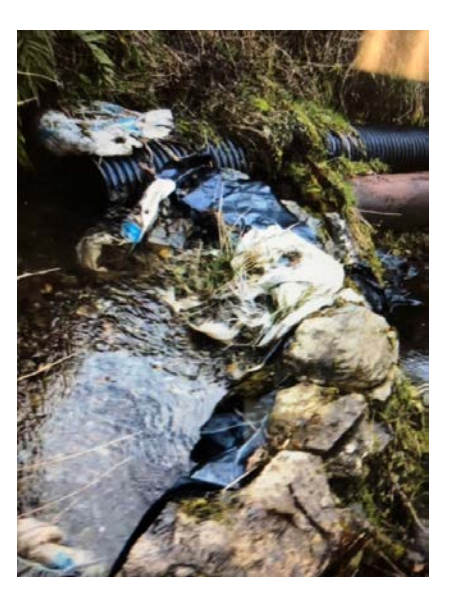
New Chums Creek Outtake