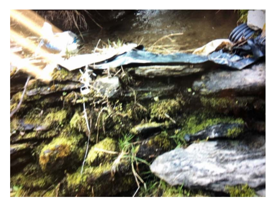
New Chums Creek Outtake Seepage (less than 5% through dam wall)