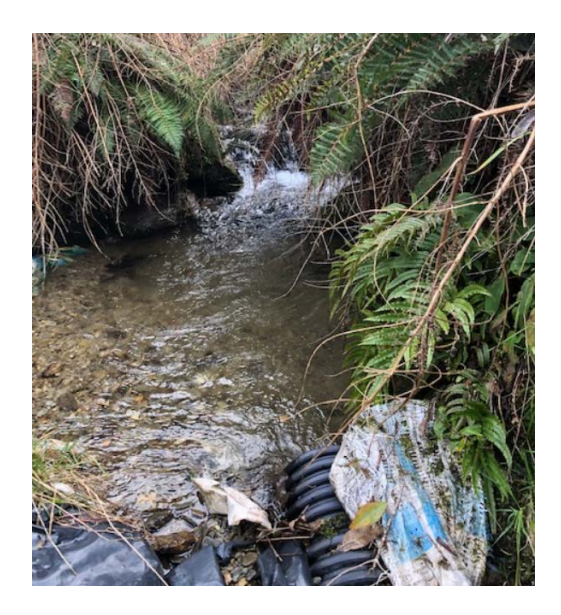
New Chums Creek Water Outtake