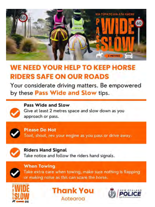
Educational Material Produced by PWASNZ in collaboration with NZ Police

NZ Trucking Association (refer evidence 12) have shared and endorsed the Pass Wide and Slow message, and its reference to road safety being a collective responsibility is appreciated. It also touched on the vulnerability hierarchy by way of trucks being the largest and safest and the need for its drivers to look after those more vulnerable. NZ TRUCKING ASSN LETTER.pdf(refer evidence 13)