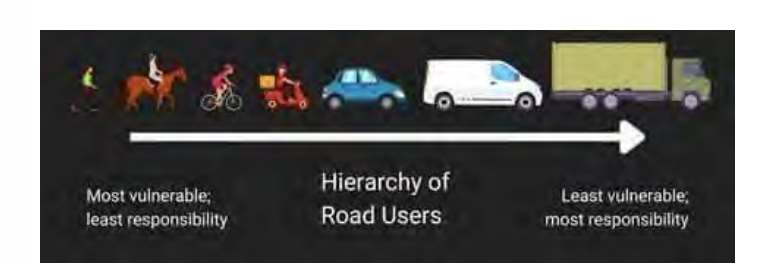
Horse riders/ carriage drivers are considered equal in vulnerability to Cyclists