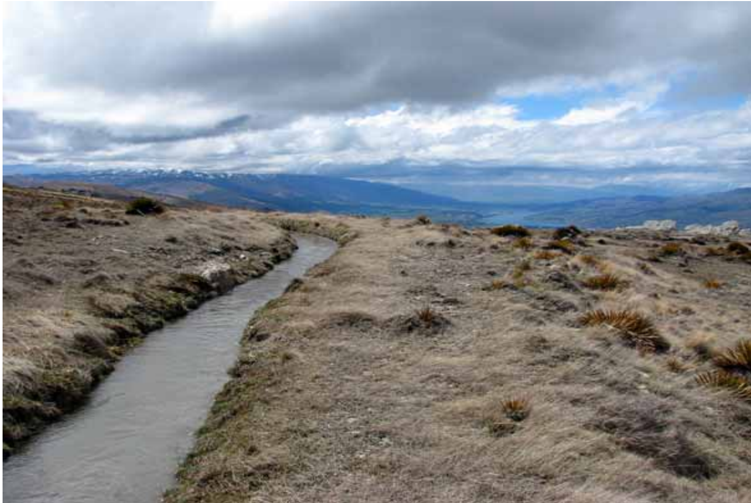
Water race high up on Carrick Range with Lake Dunstan in distance.