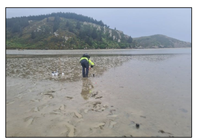
Muddy surface sediments at Site A in November 2022

The average aRPD depth in November 2022 was ~45mm at Site A and 50mm at Site B, reflecting welloxygenated conditions. This level of oxygenation is partially maintained by the presence of crabs, shellfish (e.g. cockles) and other organisms, which turn over surface sediments and create voids that allow air and water to transfer oxygen to underlying layers.