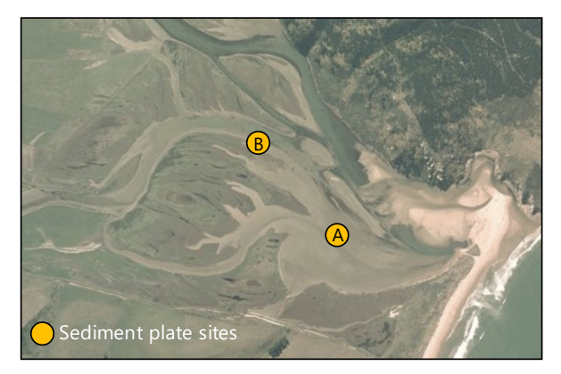
Fig. 1. Location of Shag Estuary monitoring sites.

Since December 2016, Otago Regional Council has undertaken annual State of the Environment monitoring in Shag Estuary to assess trends in the deposition rate, mud content, and oxygenation of intertidal sediments. Sediment monitoring is undertaken at two sites (Fig. 1), with the latest survey carried out on 26 November 2022.