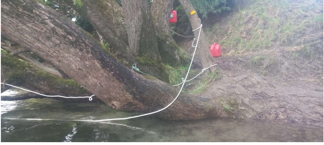
15. And this makes me wonder about the things we can't see...