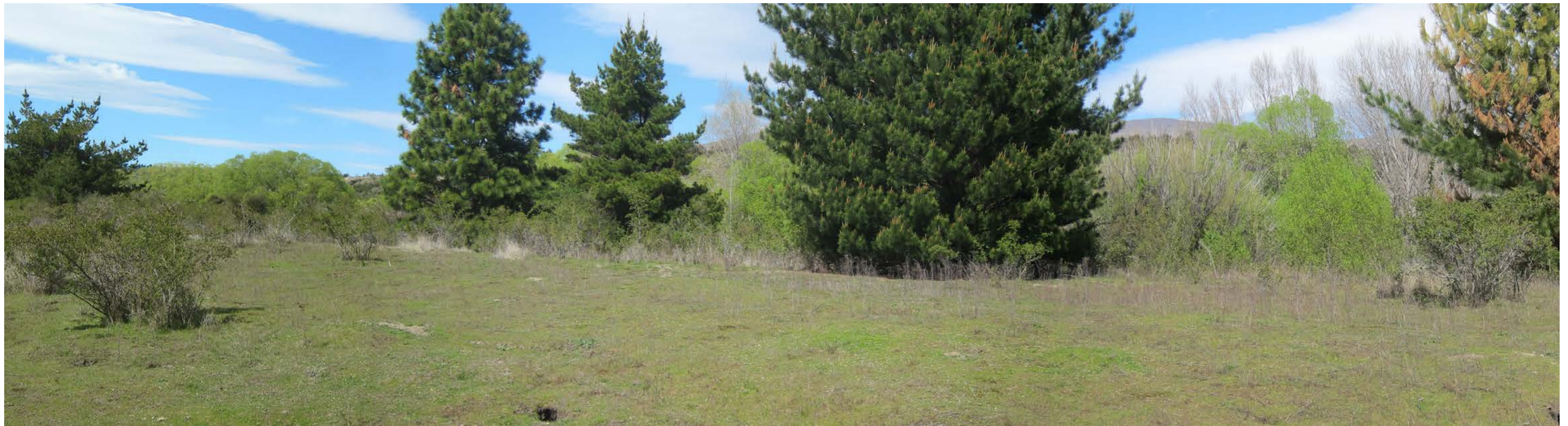
Viewpoint 4 - Looking towards the Clutha River/Mata Au from Kane Reserve. The river is fully screened by vegetation and topography.