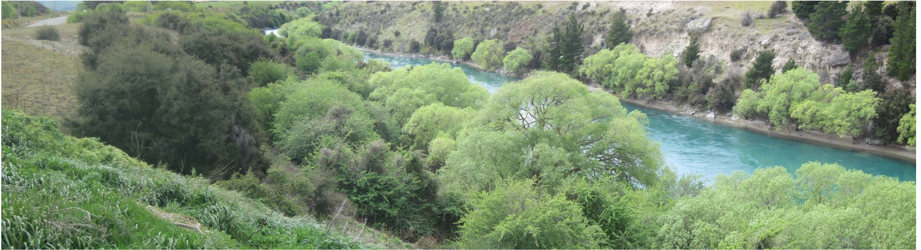
Viewpoint 15 - Looking towards the Clutha River/Mata Au from the marginal strip adjacent to SH6. A stretch of river approximately 500m is partially visible to the north.