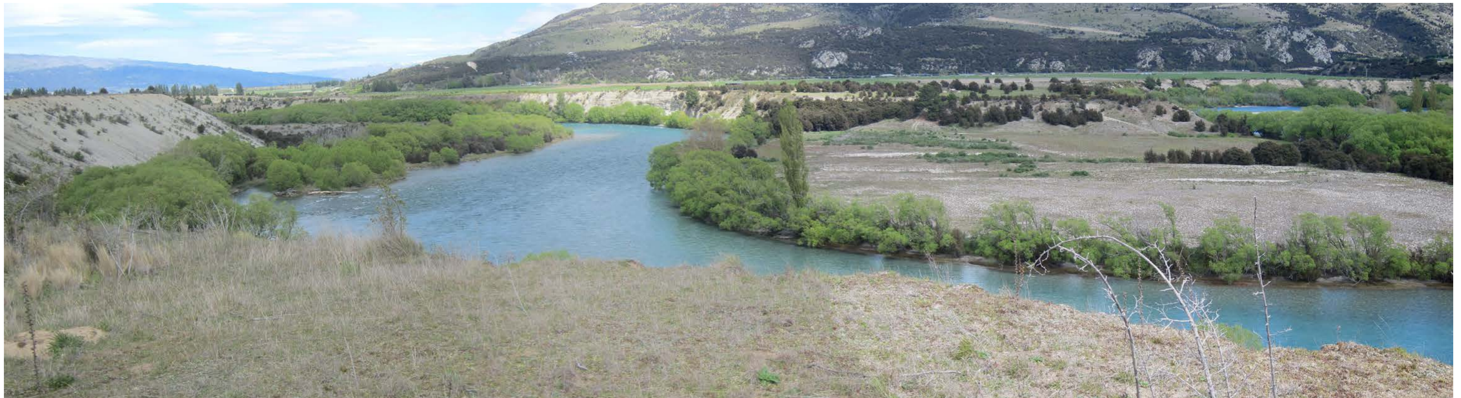
Viewpoint 8 - Looking towards the Clutha River/Mata Au from the Mata Au Scientific Reserve.