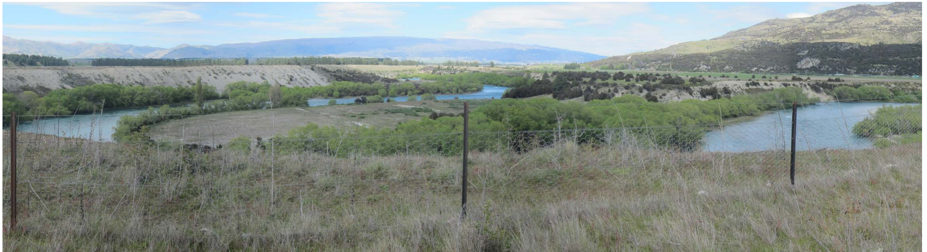
Viewpoint 10 - Looking towards the Clutha River/Mata Au from the Mata Au Scientific Reserve.