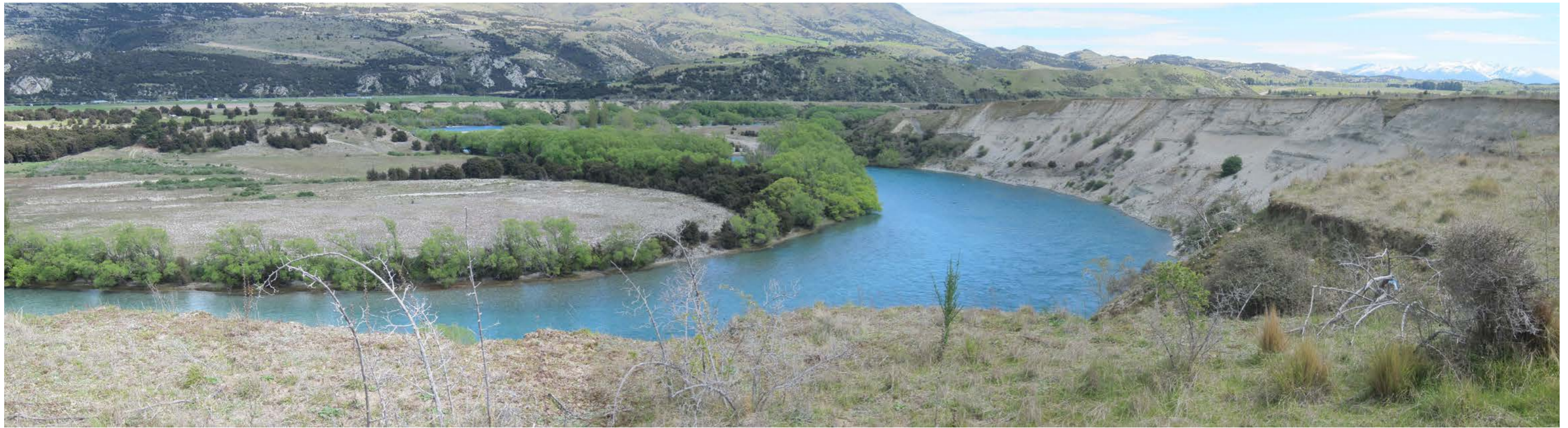
Viewpoint 9 - Looking towards the Clutha River/Mata Au from the Mata Au Scientific Reserve.