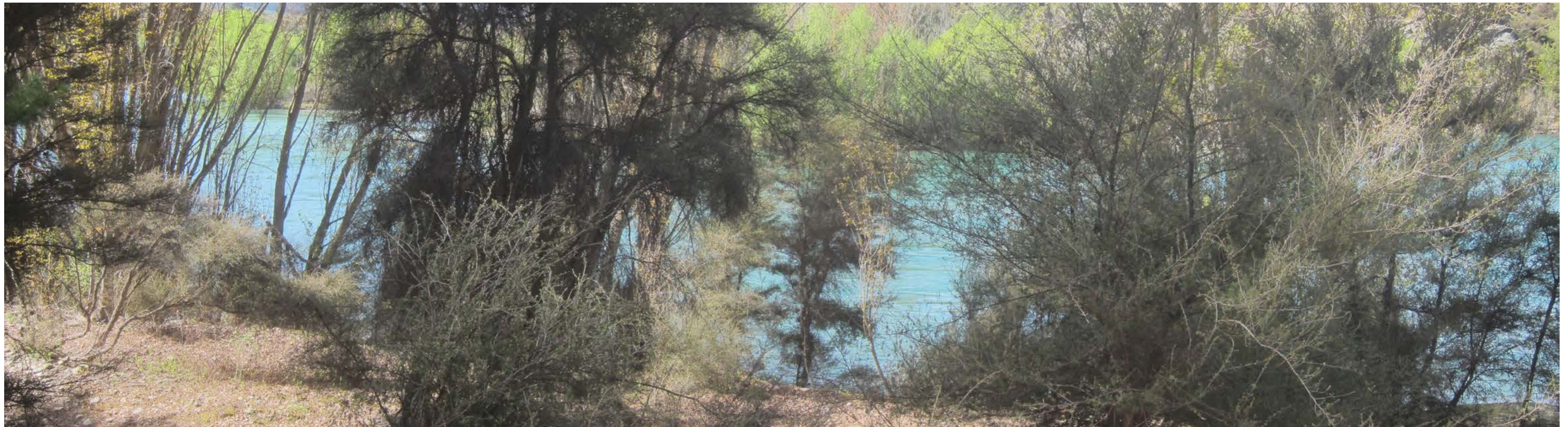
Viewpoint 3 - Looking towards the Clutha River/Mata Au from Kane Reserve. Glimpses of the river are visible through the vegetation.