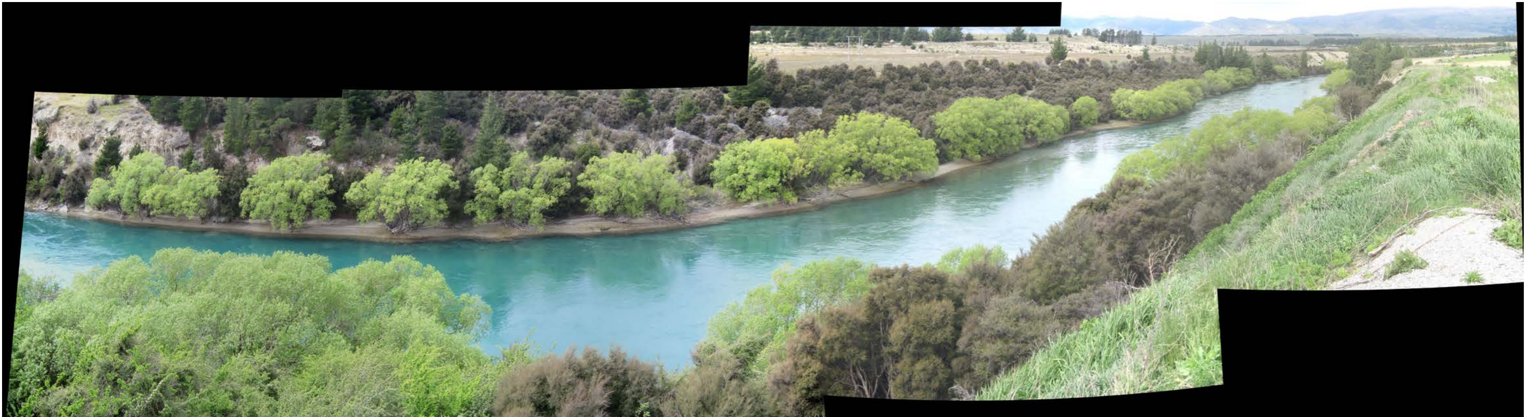
Viewpoint 16 - Looking towards the Clutha River/Mata Au from the marginal strip adjacent to SH6. A stretch of river approximately 600m is partially visible to the south