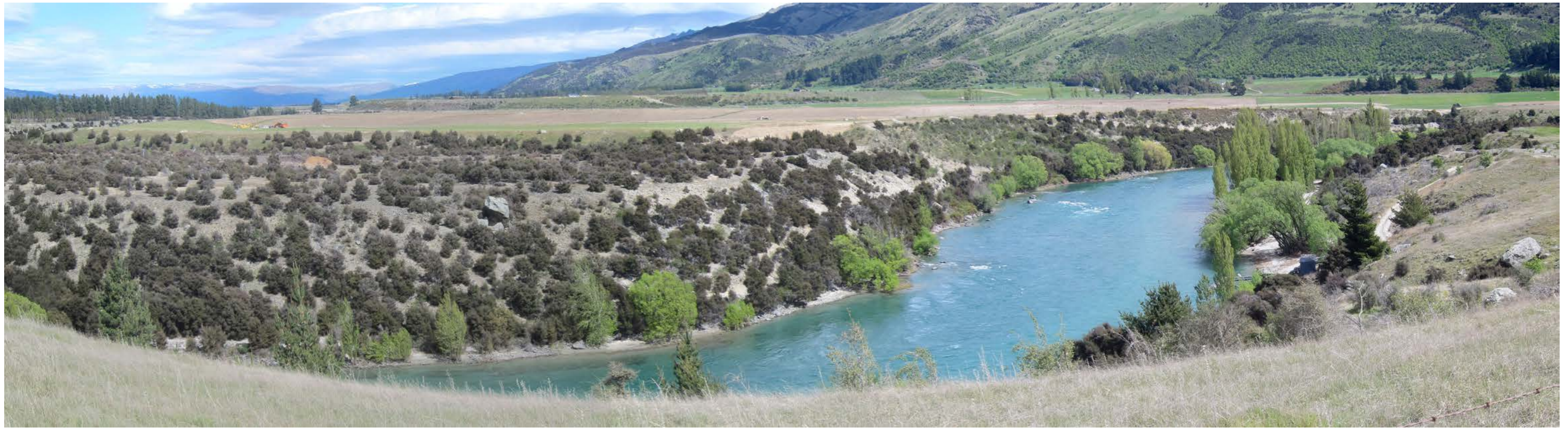
Viewpoint 11 - Looking towards the Clutha from Maori Point Road. A stretch of river approximately 350m long is partially visible to the west.