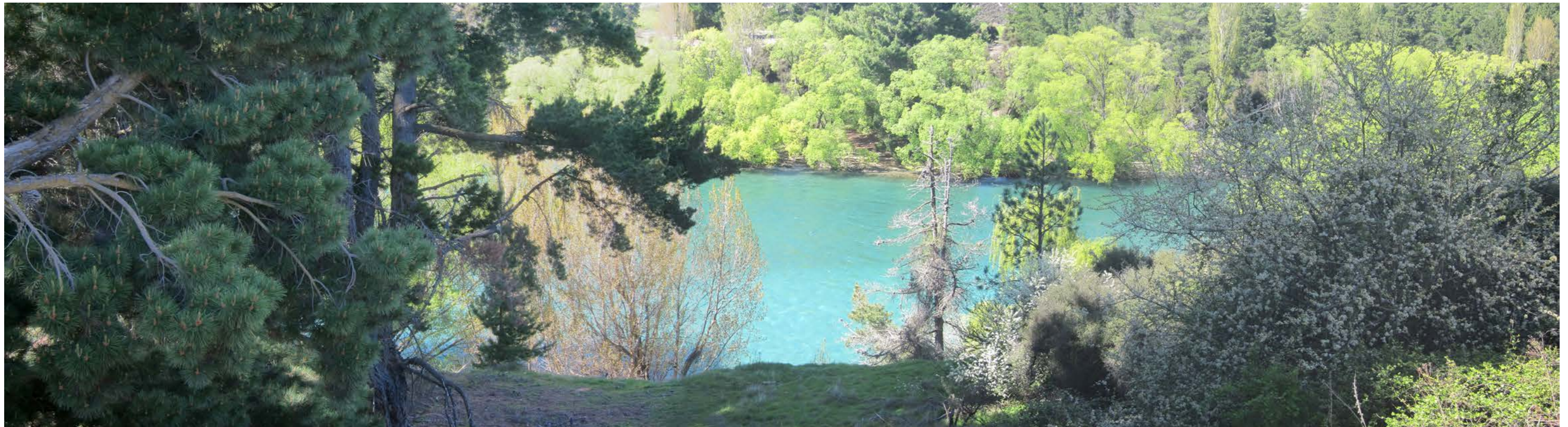
Viewpoint 1 - Looking towards the Clutha River/Mata Au from the Upper Clutha River Track. Glimpses of the river are visible through the vegetation.