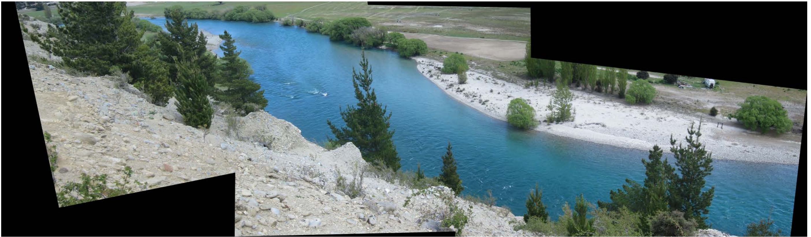
Viewpoint 7 - Looking towards the Clutha River from the Sandy Point Conservation Area. A stretch of the Clutha River approximately 1km is visible to the southwest.