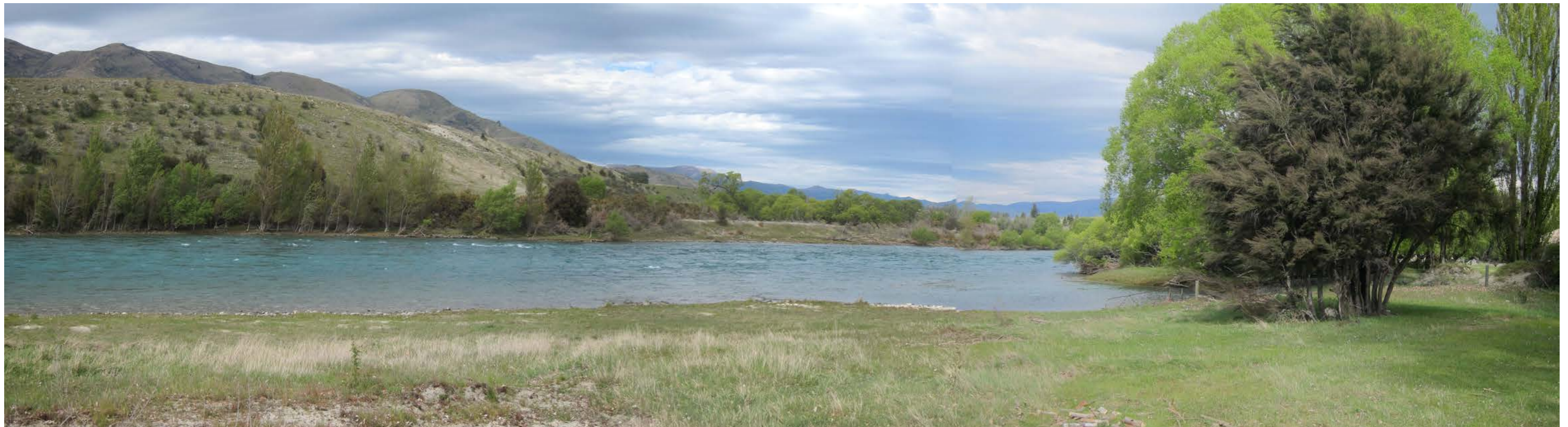
Viewpoint 14 - Looking towards the proposed slipway site from private property adjacent to the Clutha River/Mata Au.