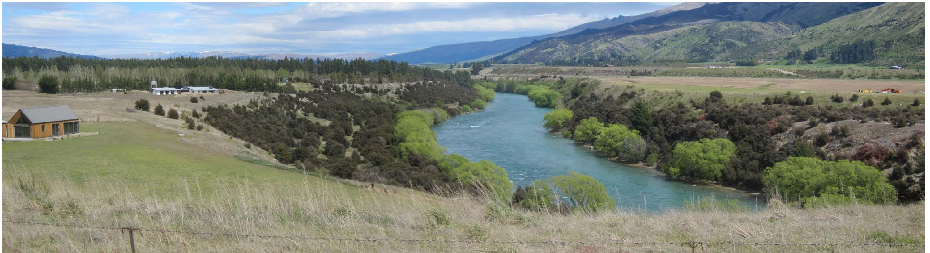
Viewpoint 12 - Looking towards the Clutha from Maori Point Road. A stretch of river approximately 1.1km long is partially visible to the southwest