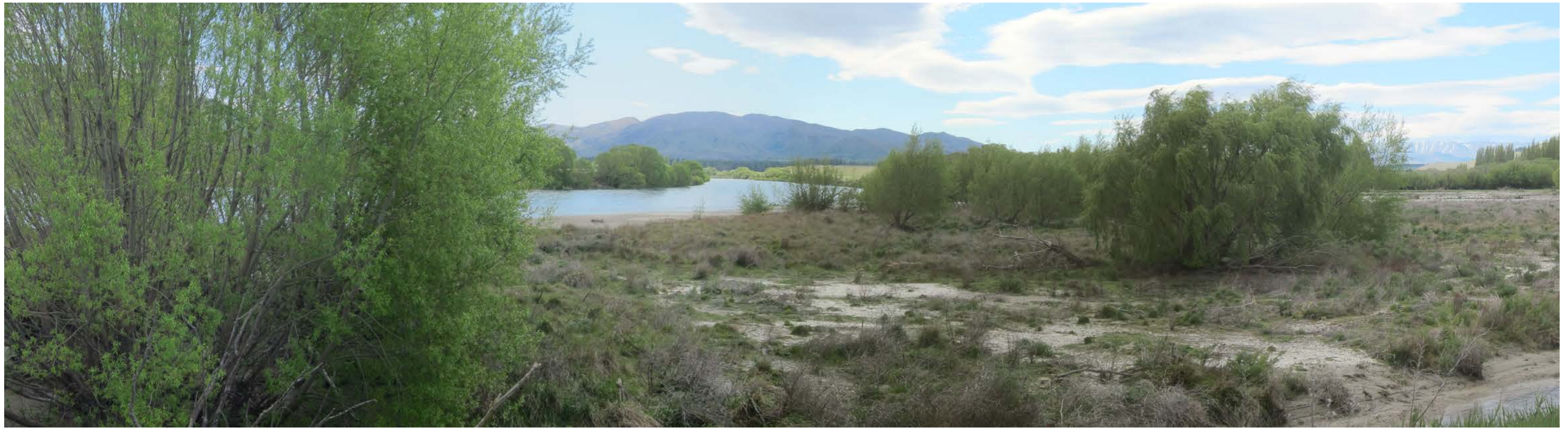
Viewpoint 13 - Looking towards the Clutha River/Mata Au from Lindis Crossing. A stretch of the Clutha River/Mata Au approximately 1.5km is visible to the north.