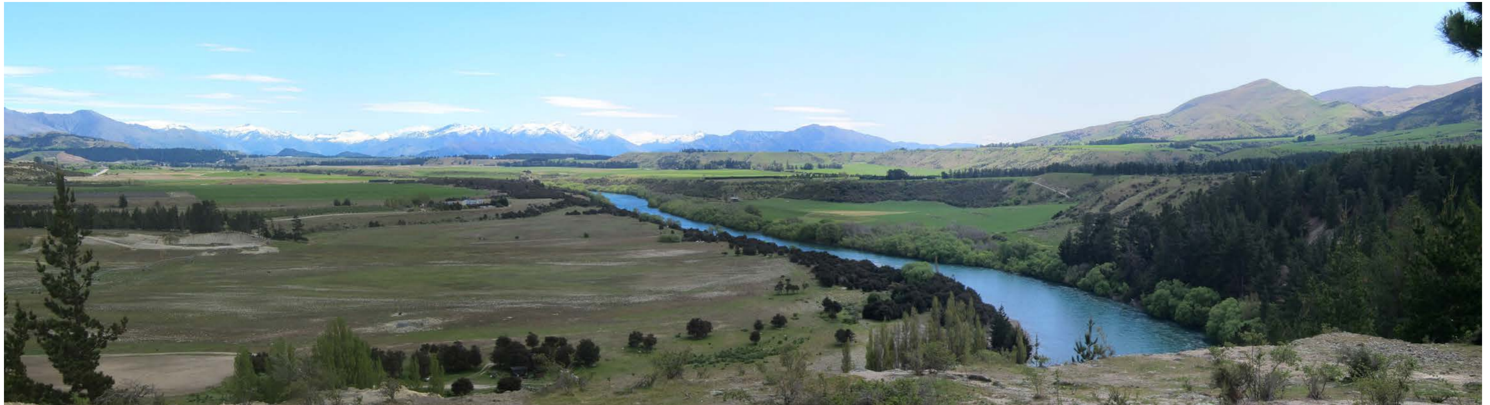
Viewpoint 6 - Looking towards the Clutha River from the Sandy Point Conservation Area. A stretch of the Clutha River approximately 2km is visible to the northwest.