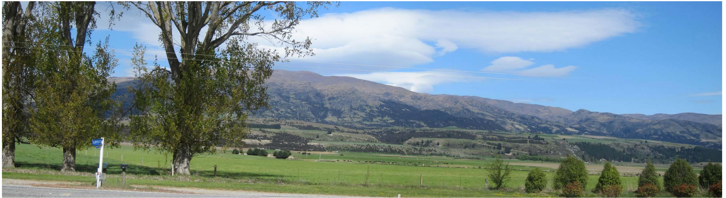
Viewpoint 5 - Looking towards unformed legal road accessing the Clutha River from the intersection of Glenfoyle Road and SH8A. The road crosses farm land and public access is not evident.