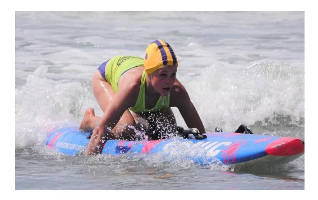
Various Photographs of Surf Sports and Brighton Athletes