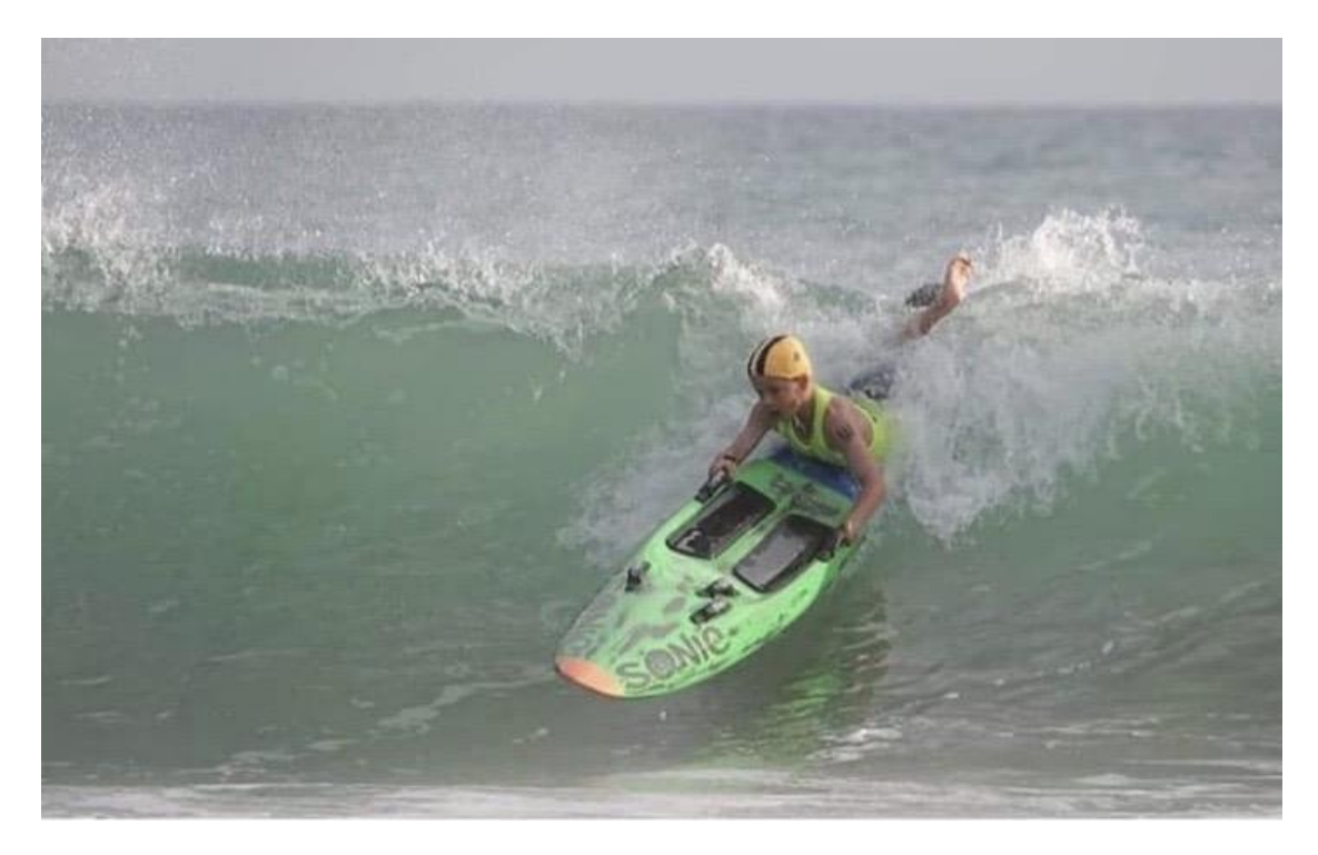
Various Photographs of Surf Sports and Brighton Athletes