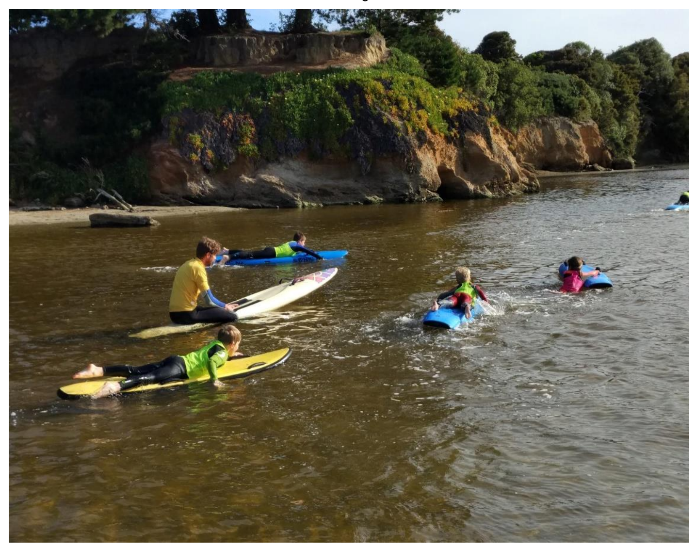
Junior training in Ōtokia Creek