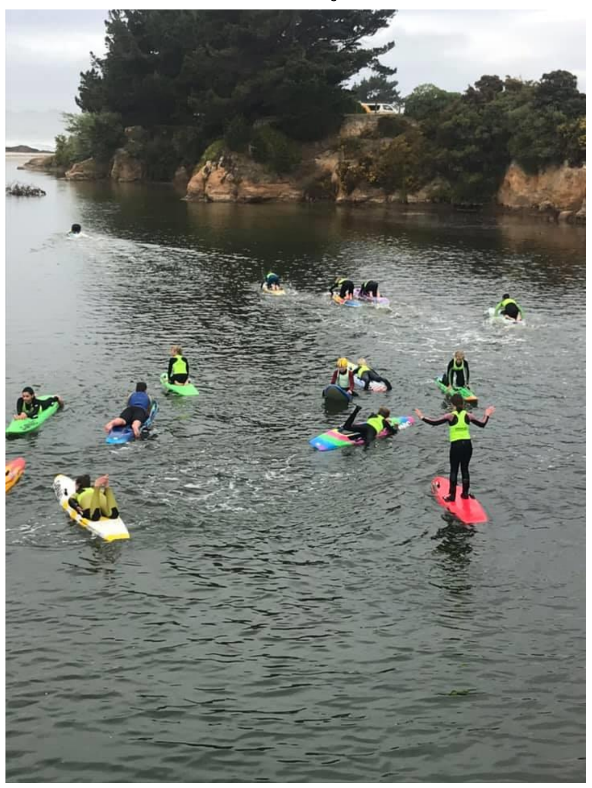
Junior training in Ōtokia Creek