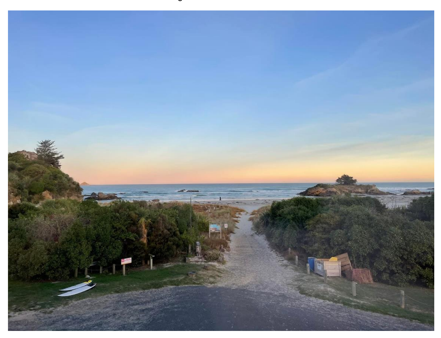
Brighton Beach from the Club House