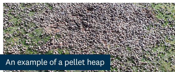
An example of a pellet heap

The sustained control programme aims to provide for ongoing control of the pest to reduce its impacts on values and spread to other properties.