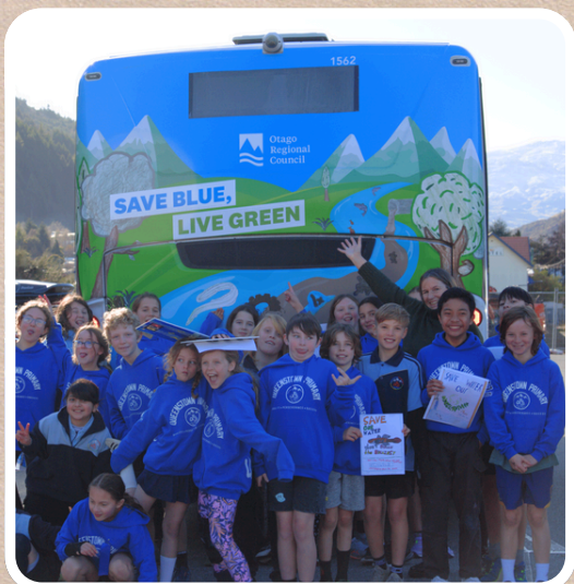
Queenstown Primary School ākonga proudly show off their bus ad in June.

Queenstown Primary School Year 5 and 6 pupils have come up with a creative way to encourage people to protect the local environment – helping to design back of the bus advertising with an important message!