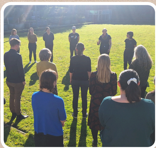
Teachers in Ōtepoti take a moment to refresh and reflect during their hui on a sunny winter day.

We're really grateful to all teachers and schools that joined us for these exhilarating days of connection and professional development and we look forward to seeing what comes next for these schools!